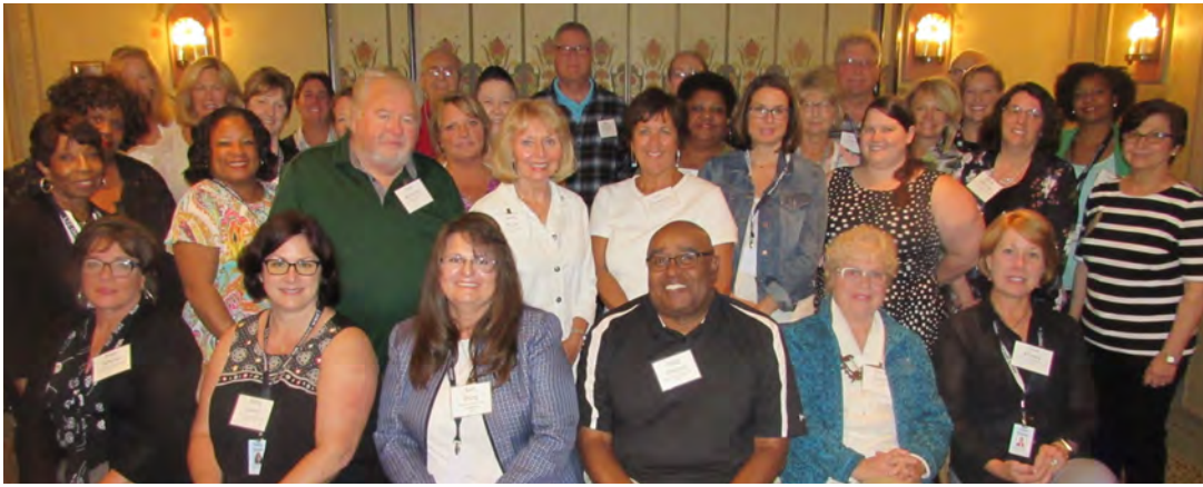
MLTCOP's Local & Volunteer Ombudsman Quarterly Training in Frankenmuth (September 2017).