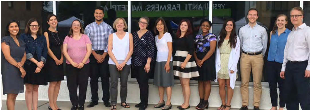
MAP staff in front of our new building in downtown Ypsilanti.